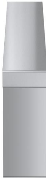
589150 (MCNABAAOOO) Closed Work Top, one-side operated